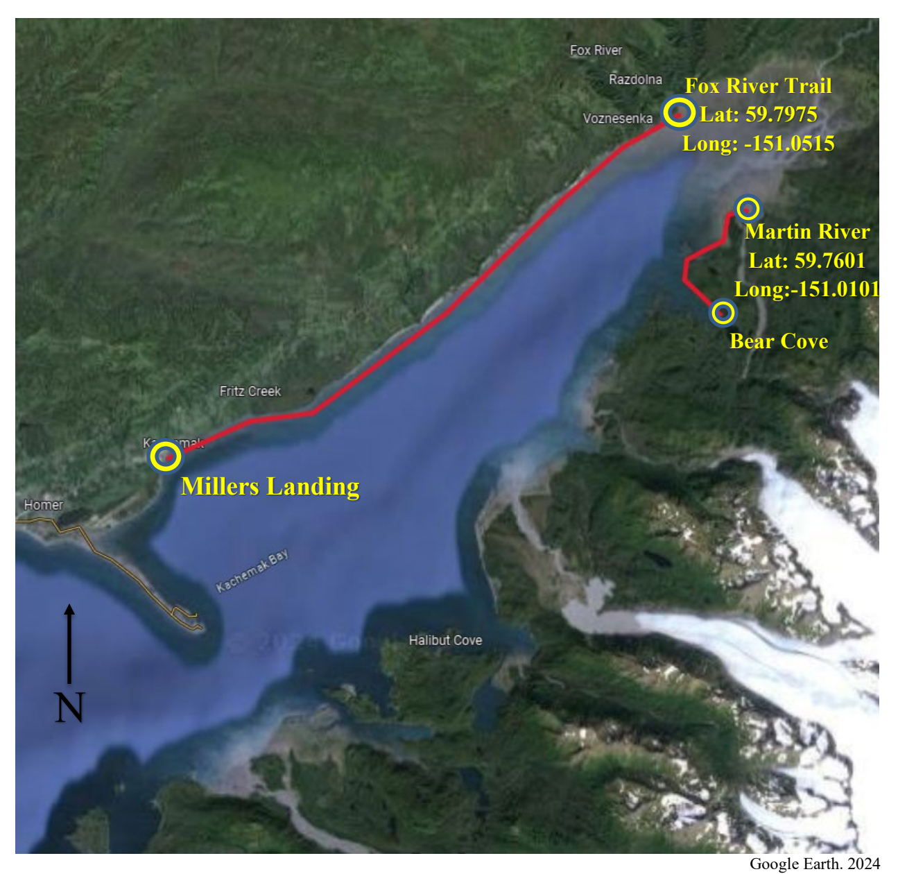
Fig 2. Corridors 2 & 3: Miller's Landing to the Fox River Trail and Martin River to Bear Cove.