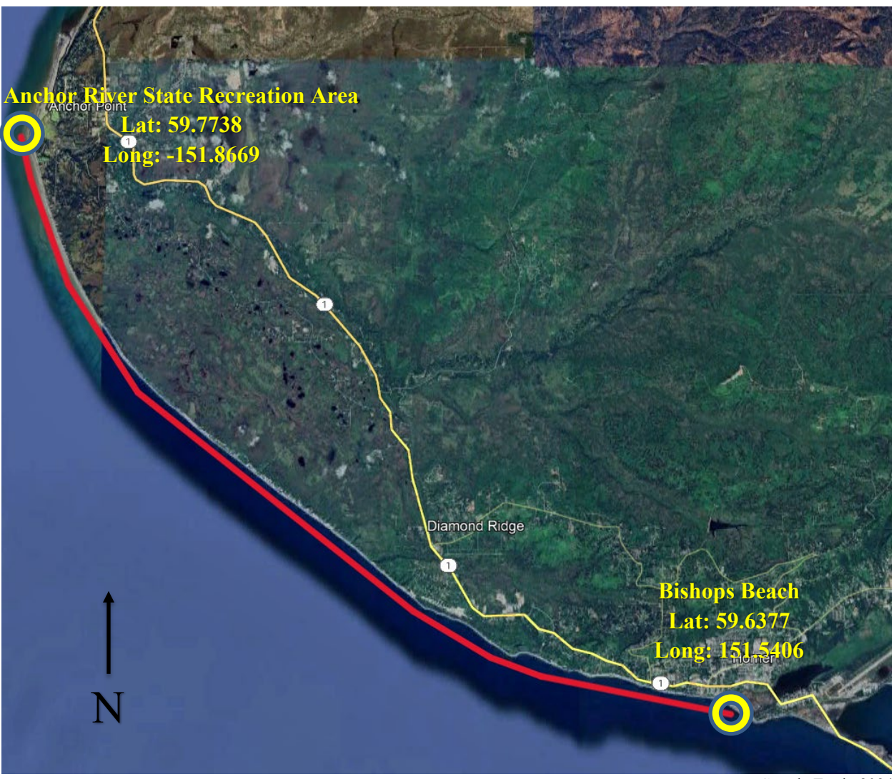
Fig 1. Corridor 1: Anchor River State Recreation Area to Bishops Beach.