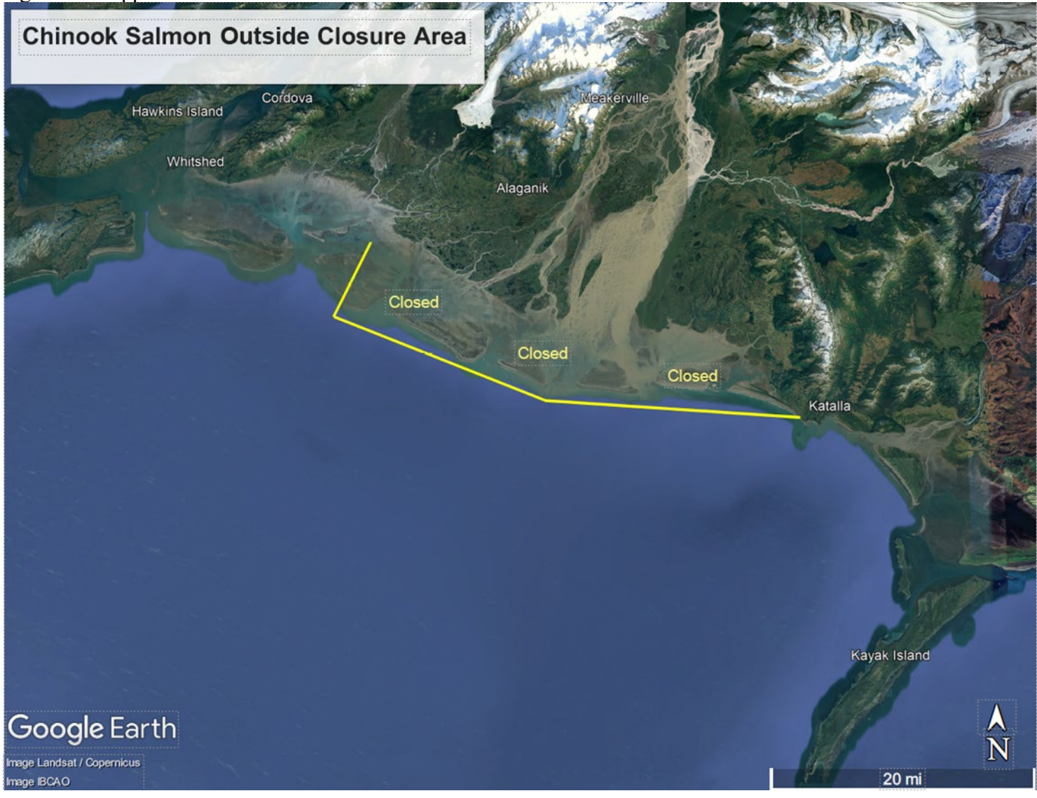
Figure 1.- Copper River District Chinook salmon outside closure area.